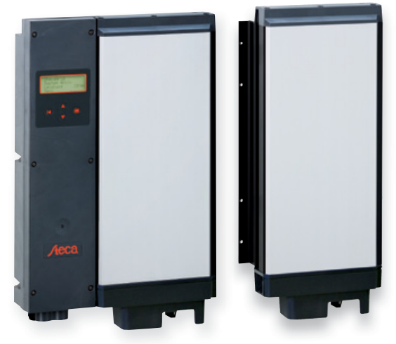
StecaGrid 2010+ Master not shown: StecaGrid 2000+ Master

To reduce the installation time, the StecaGrid 2010+ inverter has an integrated DC circuit breaker. For safety reasons, the cable cover located above the DC connector can only be removed when the DC circuit breaker is switched off.